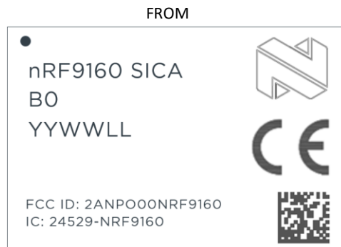
Fig 1 Sample current marking for SICA variant

Marking revision to add country-specific certification numbers