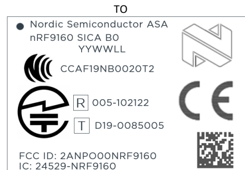
Fig 2 Sample new marking format for SICA variant

This is a running change. Parts with revised marking will be delivered as soon as stock with old marking is depleted.